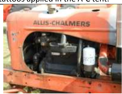
Interesting 433 A-C engine swap into a WD-45.