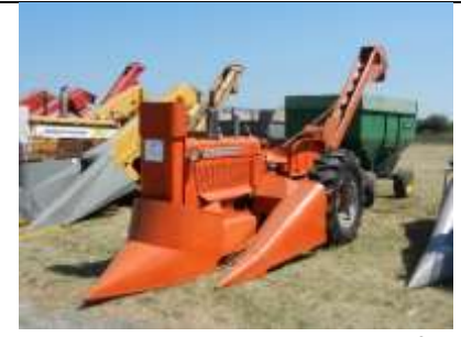
D-17 with mounted picker ready for the field.