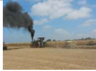
110 HP Case steam engine pulling a modern 10 furrow plow in hard dry ground.